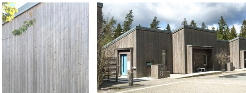
Linax natural that has greyed over time. Natural variations depending on environmental conditions.

* for the full warranty, see www.bitus.se