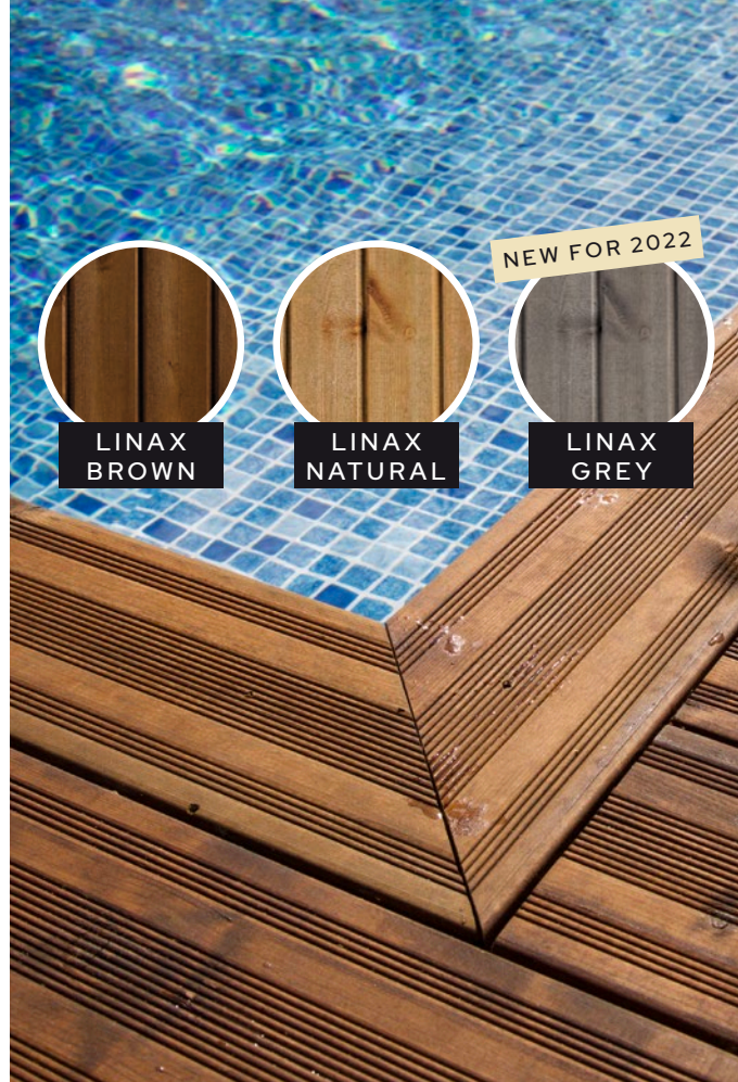
Linax Brown profiled

Our wood preservation facility offers traditional wood preservation treatment as stipulated in a range of certificates, such as CTB, NTR and BS. Bitus offers the Linax product, a sustainable timber with double wood preservation.