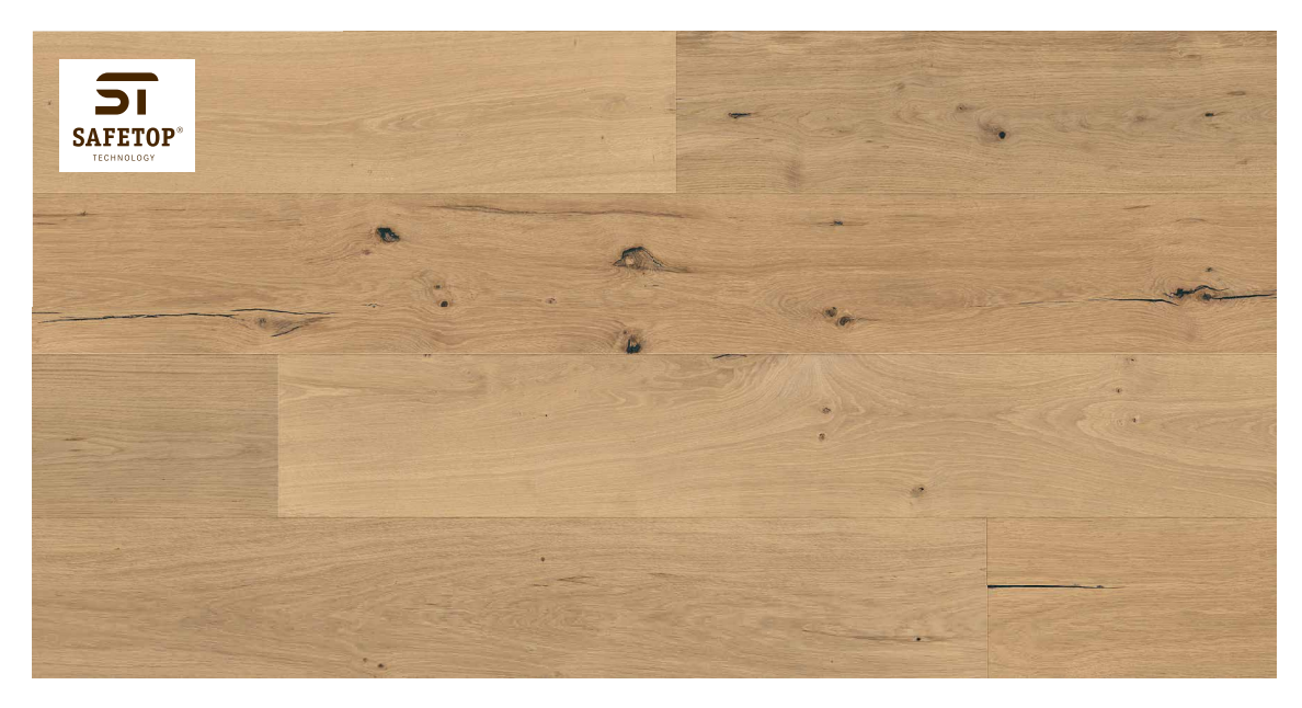
15/4 x 260 x 2,800 mm