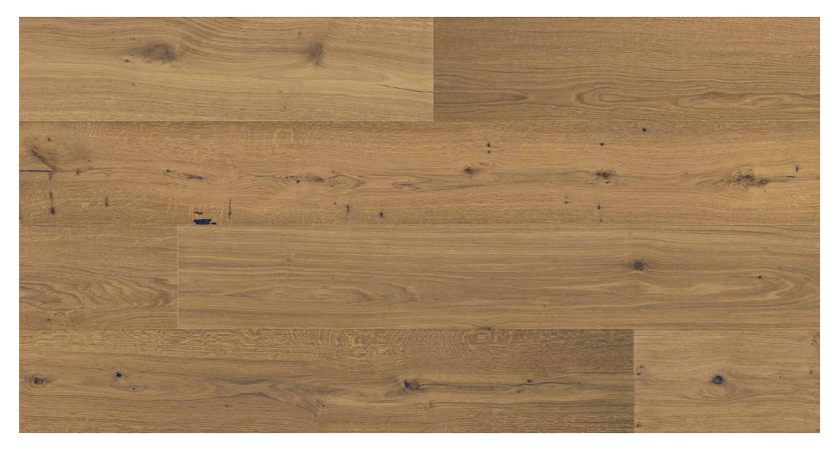
15/4 x 260 x 2,800 mm