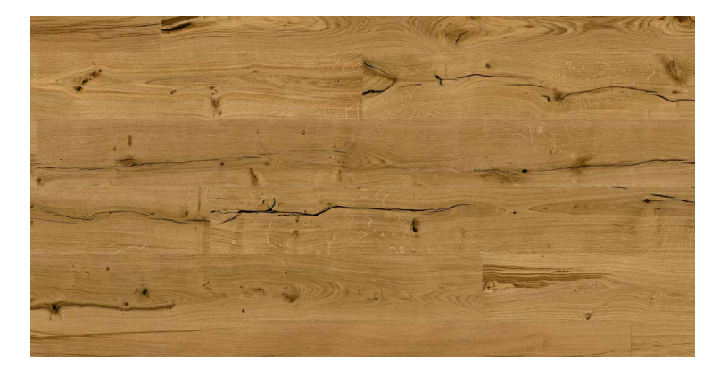
OAK SOKRATES brushed, natural oiled