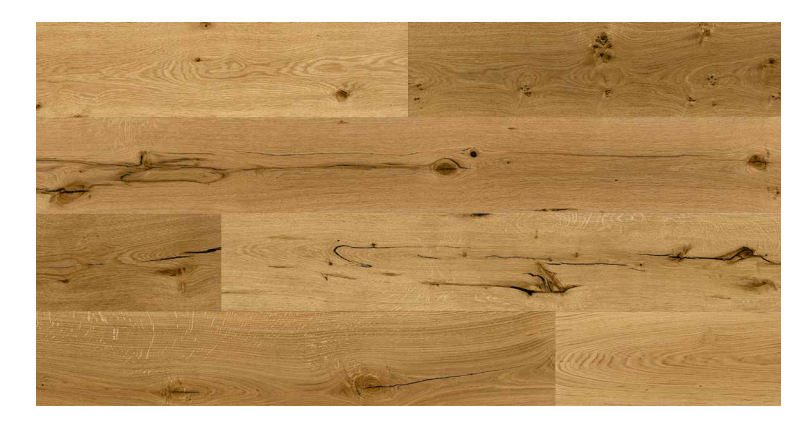
OAK LAZARUS brushed, natural oiled