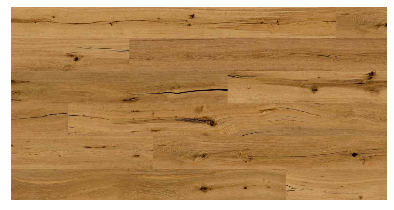
OAK TEBERIUS brushed, natural oiled